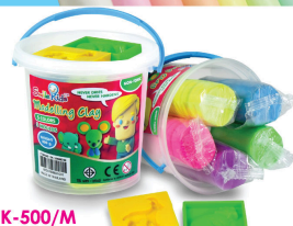
SK-500/M Modelling Clay 500 Gr. 5 colors with 2 moulds Size: 10.5x10.5 cm. (Packaging) Packing: 0/24 | GW/CTN: 14.5 | CBM: 0.033