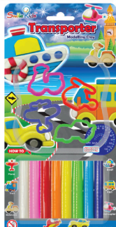
SK-800MA/VH/VHR/AH Modelling Clay 100 Gr. 8 colors