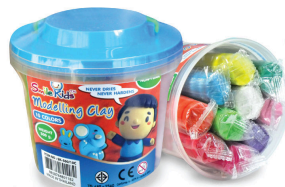
SK-500/10C Modelling Clay 500 Gr. 10 colors Size: 11.5x10 cm. (Packaging) Packing: 0/24 | GW/CTN: 14.5 | CBM: 0.035