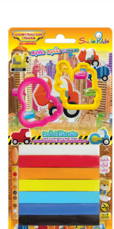
SK-130/SF/TF/CS Modelling Clay 130 Gr. 7 colors