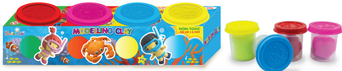
SK-B240/4C Modelling Clay 240 Gr. 4 colors in bucket (No Sticker) Size: 5.8x23x4.5 cm. Packing: 0/24 | GW/CTN: 8.0 | CBM: 0.022