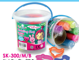
SK-300/M/B Modelling Clay 300 Gr. 6 colors with 3 moulds Size: 10.5x10.5 cm. (Packaging) Packing: 0/24 | GW/CTN: 9.4 | CBM: 0.033