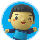
SK-275-20C Modelling Clay 275 Gr. 20 colors (16 reg+4ne) in clipbox with sticker label Size: 11.5x14.5x3 cm. (Packaging) Packing: 0/10 | GW/CTN: 3.6 | CBM: 0.008