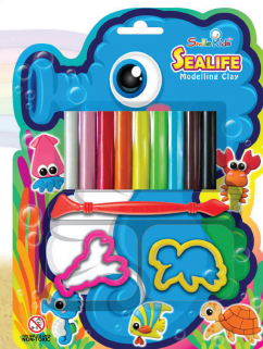
SK-110SP/SE/TR Modelling Clay 110 Gr. 9 colors

With 2 moulds and 1 tool. Size: 18.2x24.4 cm.