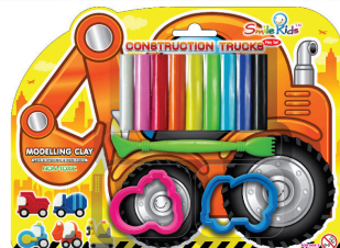
SK-110TN Modelling Clay 110 Gr. 9 colors

With 2 moulds and 1 tool. Size: 18.2x24.4 cm. Packing: 18/72 | GW/CTN: 11.0 | CBM: 0.059