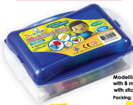
SK-130-12C/8MR Modelling Clay 130 Gr. 12 colors with 8 moulds and 1 roller in lunch-box with sticker label Size: 13x18x6 cm. (Packaging) Packing: 12/24 | GW/CTN: 8.0 | CBM: 0.045