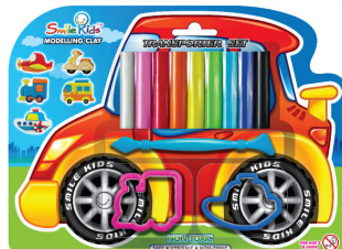
SK-110V Modelling Clay 110 Gr. 9 colors

With 2 moulds and 1 tool. Size: 19.3x21 cm. Packing: 18/72 | GW/CTN: 11.0 | CBM: 0.054