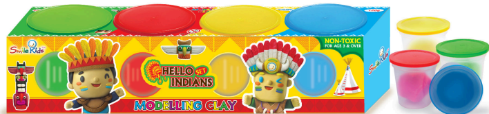
SK-B480/4C Modelling Clay 480 Gr. 4 colors in bucket (No Sticker) Size: 8x32x6.9 cm. Packing: 0/18 | GW/CTN: TBA | CBM: TBA