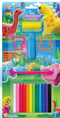
SK-100MT (DN/FL) Modelling Clay 100 Gr. 12 colors

With 4 moulds, mini roller and 1 tool. Size: 16x32 cm.