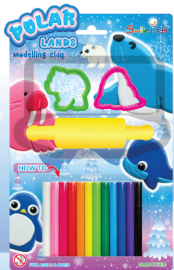
SK-100/2MR Modelling Clay 100 Gr. 12 colors

With 2 moulds, and 1 roller in blister card Size: 18x28.5 cm.