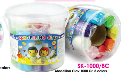
SK-1000/8C Modelling Clay 1000 Gr. 8 colors Size: 14x13 cm. (Packaging) Packing: 0/12 | GW/CTN: 14.0 | CBM: 0.042