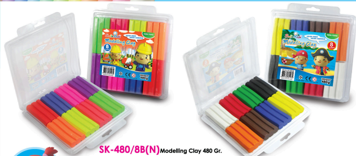
SK-480/8B(N) Modelling Clay 480 Gr. 8 colors in bar shape in pvc clam-shell box with sticker label Size: 18x19x1.5 cm. Packing: 10/20 | GW/CTN: 11.5 | CBM: 0.015